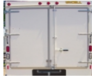
Full-width rear swing-out doors