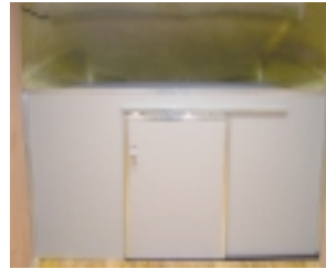
Sliding cab-access door