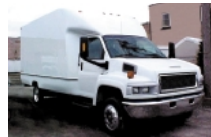
Available for C4500/5500 series

For more options and pictures, view www.unicell.com or call 800-628-8914.