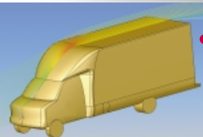
Wind tunnel test model shows smooth air flow over body resulting in low drag. This translates to more miles per gallon of fuel.