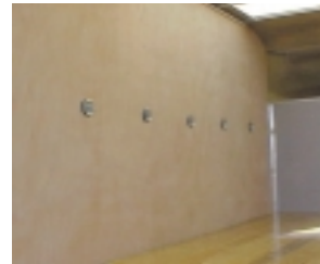
Plywood lining with D-rings