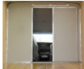
Walk-through cab with 6' door