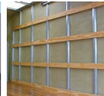
Standard slat lining