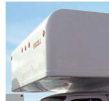
Attic storage over cab