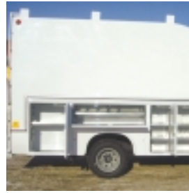
4 Store items big and small