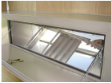
2 Easy access inside and out