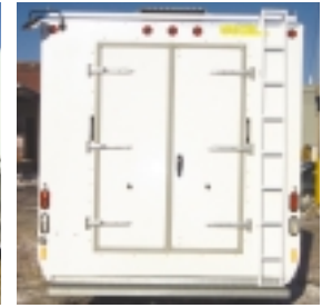
5 50" wide swing-out doors shown with optional ladder rack and removable rear step ladder