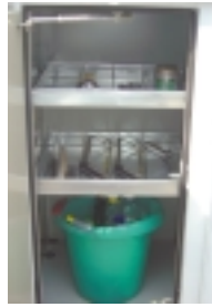
3 A place for everything