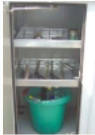
3 A place for everything