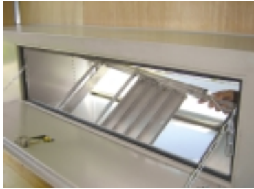
2 Easy access inside and out