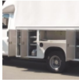
4 Store items big and small