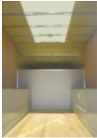
1 Bright and roomy interior