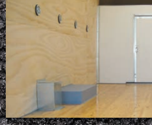
Plywood lining with D-rings