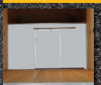
Sliding cab-access door