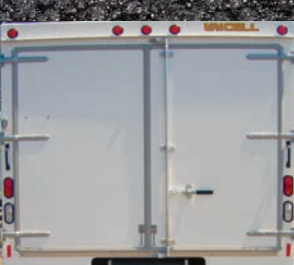
Full width rear swing-out doors