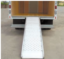
Aluminum sliding walk ramp

Some available equipment. View more on our website at www.unicell.com