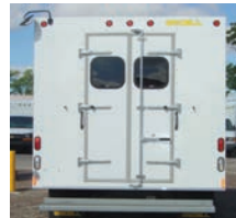
Narrow swing-out rear doors with windows