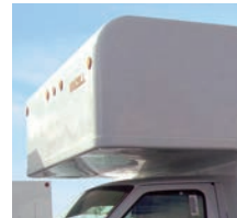
Attic storage over cab